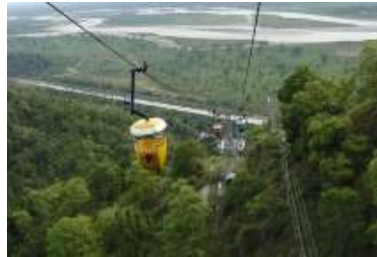
MAA CHANDIDEVI UDANKHATOLA HARIDWAR – UTTARAKHAND