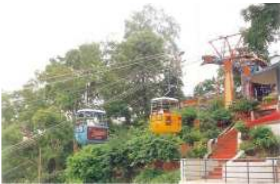
MAA MANSADEVI UDANKHATOLA HARIDWAR – UTTARAKHAND