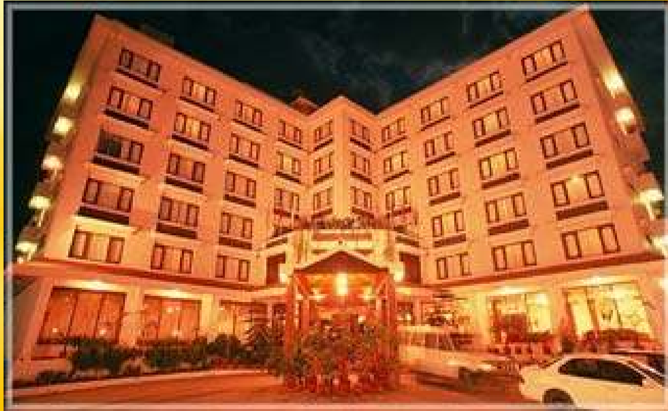
Hotel Vaishali ,Kathmandu