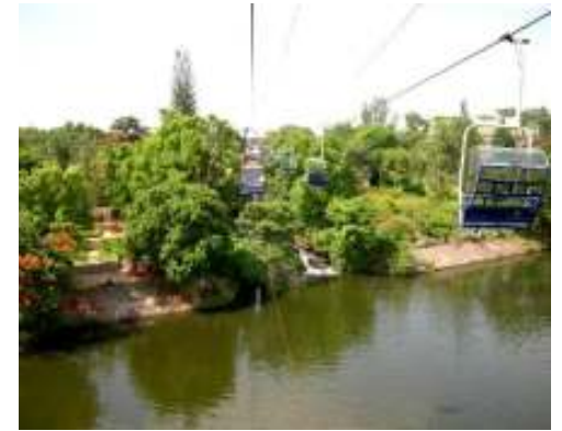
MALAMPUZHA GARDENS KERALA