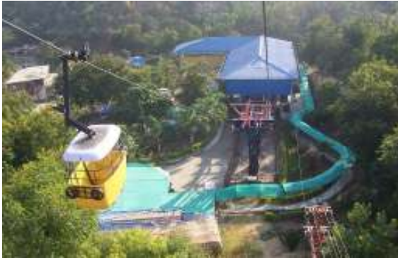
MAA AMBAJI UDANKHATOLA AMBAJI - GUJARAT