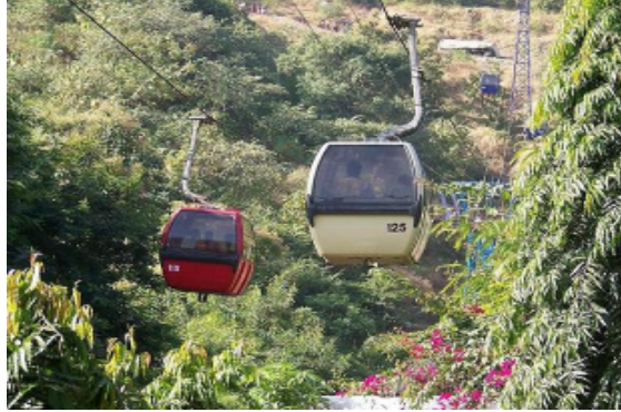
MAA MAHAKALIKA UDANKHATOLA, PAVAGADH - GUJARAT